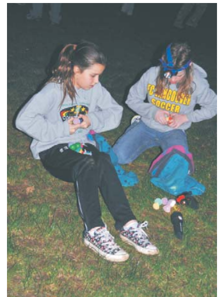
These night hunters—one wisely wearing a headlamp—check the eggs they have gathered at a past Easter Egg Hunt for those who are 10 through 12.

For our younger crowd, join us at the Easter Day Hunt where eggs will be hidden for ages 2 through 9 years. This event is free and will also take place in Crown Park at 1:30 p.m. sharp! Candy and prize-filled eggs will be hidden in designated egg hunting areas color-marked for age groups 2-3, 4-5, 6-7, and 8-9. Children should bring a basket or bag for their eggs. Children must be