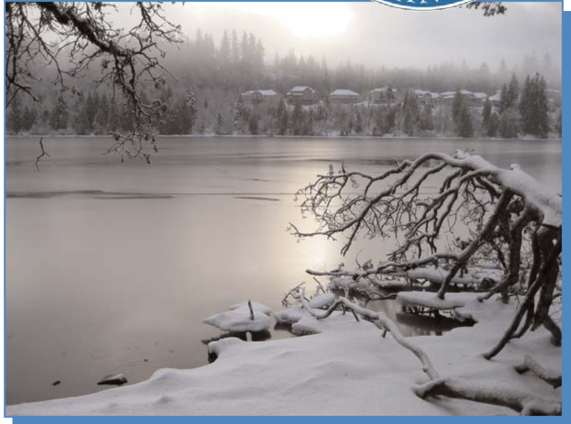
Lacamas Lake appears serene in this late December.

On a brighter side, a number of new businesses have come to town to fill in many of the vacancies. I've made an effort to welcome most of the new business owners, who are local residents. If you get a chance, stop by and check out their products and services as well as those of our existing companies. And if you can, try to buy locally, as your dollars stay within the community and help our families and entrepreneurs. In closing, I'd like to wish our entire community a better 2009; while we are in difficult economic times, together we will endure. ■