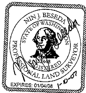
EXHIBIT "A" PAGE 1 OF 2

Subject to easements and restrictions of record.