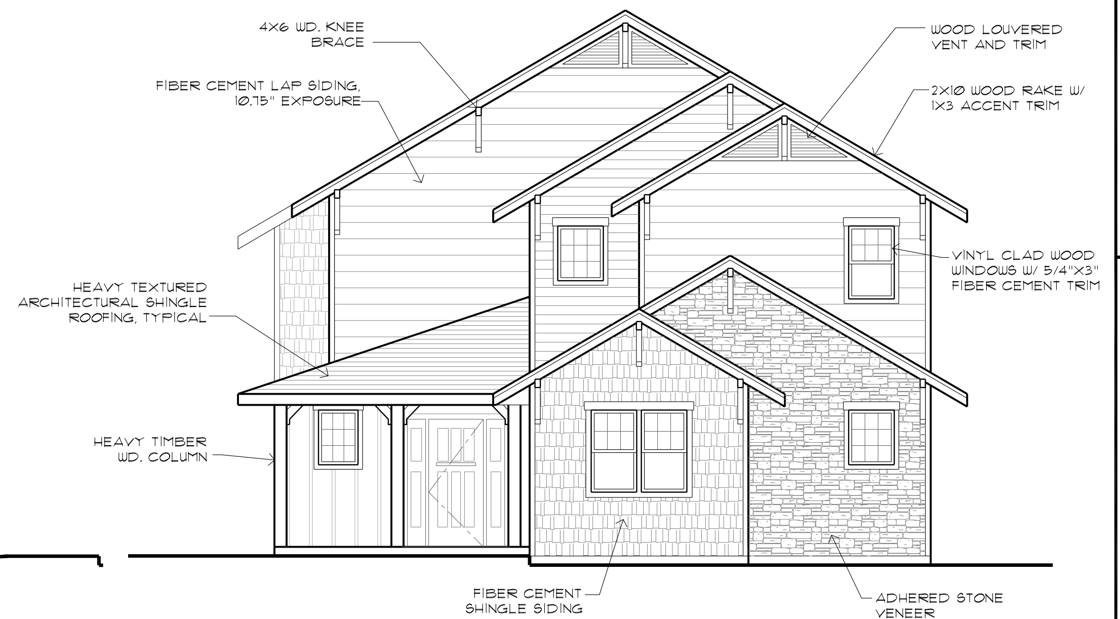
1 NORTH (STREET FRONT) ELEVATION HOUSE PLAN TYPE B A6.2 3/16" = 1'-0"