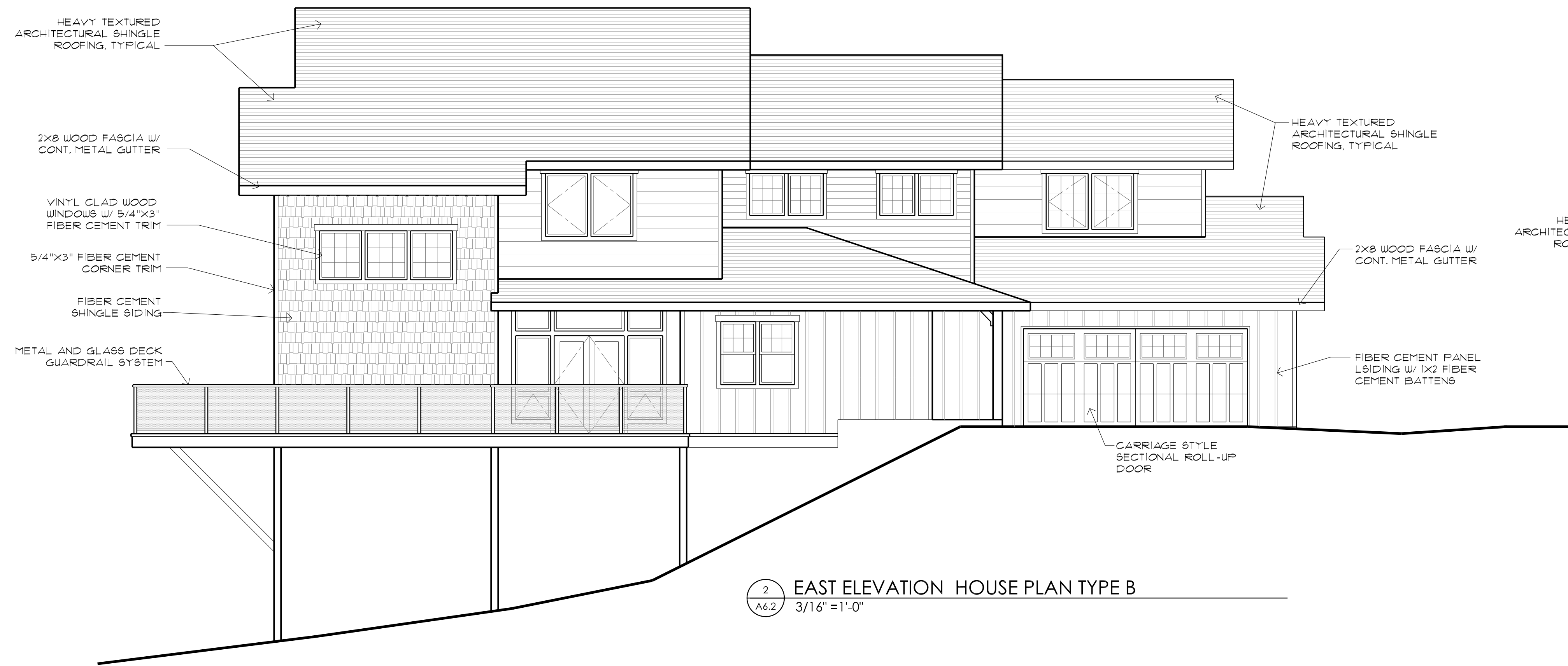
2 EAST ELEVATION HOUSE PLAN TYPE B A6.2 3/16" = 1'-0"