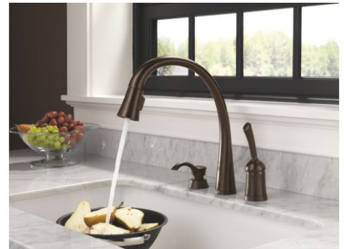
Tap Into Quality

Check out this helpful website at www.epa.gov/watersense/fixaleak