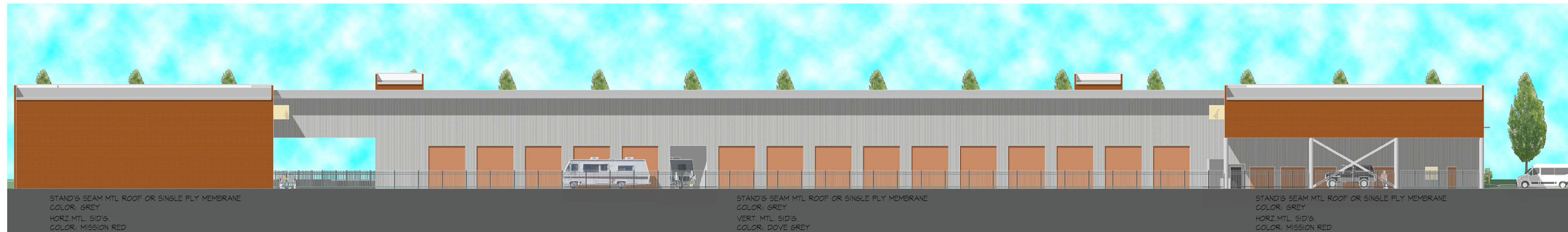
4 CONCEPTUAL EAST ELEVATION SCALE: 1/16" = 1'-0"

PRELIMINARY NOT FOR CONSTRUCTION SUBJECT TO APPROVAL