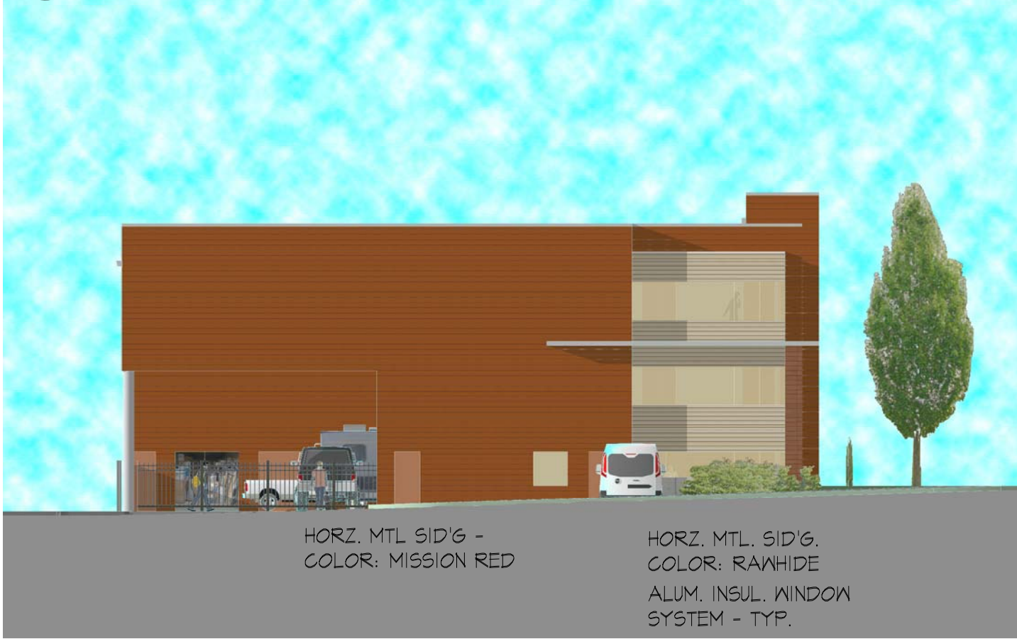
2 CONCEPTUAL NORTH ELEVATION SCALE: 1/16" = 1'-0"