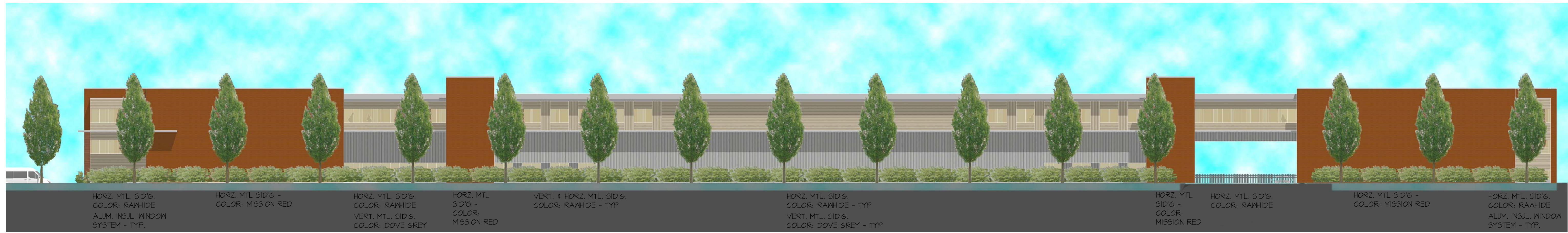
1 CONCEPTUAL WEST ELEVATION SCALE: 1/16" = 1'-0"